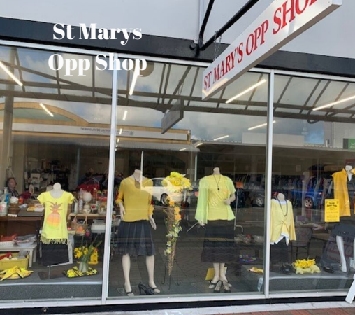
St Marys Opp Shop